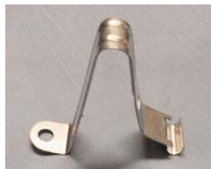
Stainless Steel Wheel Rim Mount Bracket

WHEEL MASTERS America's Leader in Wheel Cover Systems and Tire Accessories