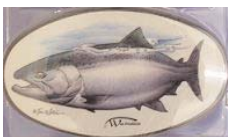
King Salmon 02073 (WP212C) 1 pk $21.99