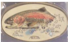
Rainbow Trout 02070 (WP104C) 1 pk $21.99