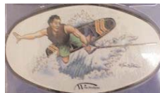
Wake Boarder 02071 (WP110C) 1 pk $21.99