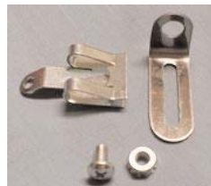
Stainless Steel Pinch Clip Bracket

02023 (9032) 1 pk Wheel/Rim Mount Bracket $3.69