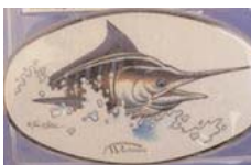
Blue Marlin 02033 (WP101C) 1 pk $21.99