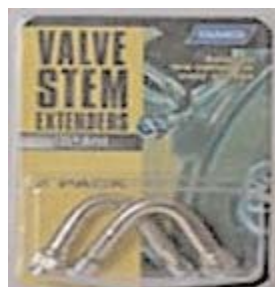
Valve Stem Extensions - 135 Degree