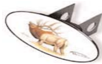
Elk 02060 (WP204C) 1 pk $21.99