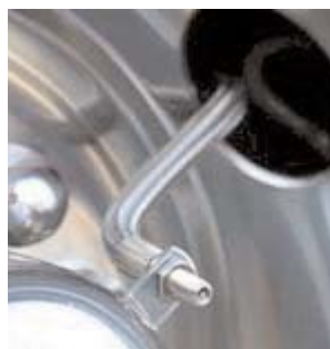
Valve Stem Extensions

02025 (9045) 1 pk Pinch Clip Bracket $3.95