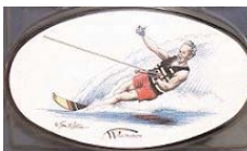
Water Skier 02064 (WP109C) 1 pk $21.99