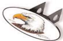
Eagle 02069 (WP220C) 1 pk $21.99