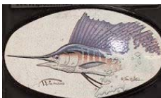
Sailfish 02061 (WP207C) 1 pk $21.99