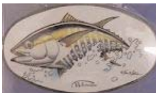
Tuna 02034 (WP102C) 1 pk $21.99