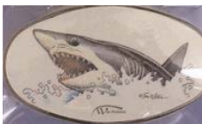
Shark 02062 (WP099C) 1 pk $21.99